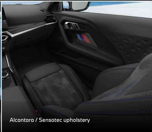
Alcantara / Sensatec upholstery