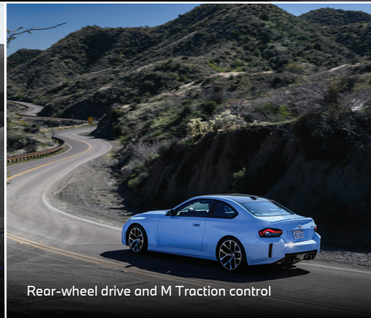
Rear-wheel drive and M Traction control