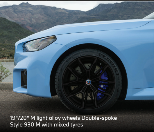
19"/20" M light alloy wheels Double-spoke Style 930 M with mixed tyres

Car specifications may vary from the model shown. Options and features available are model-dependent.