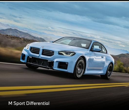
M Sport Differential