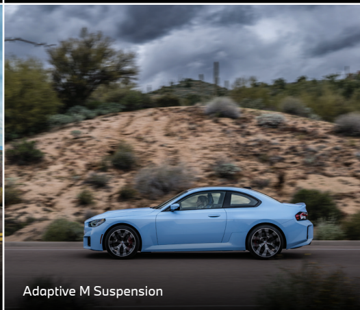
Adaptive M Suspension